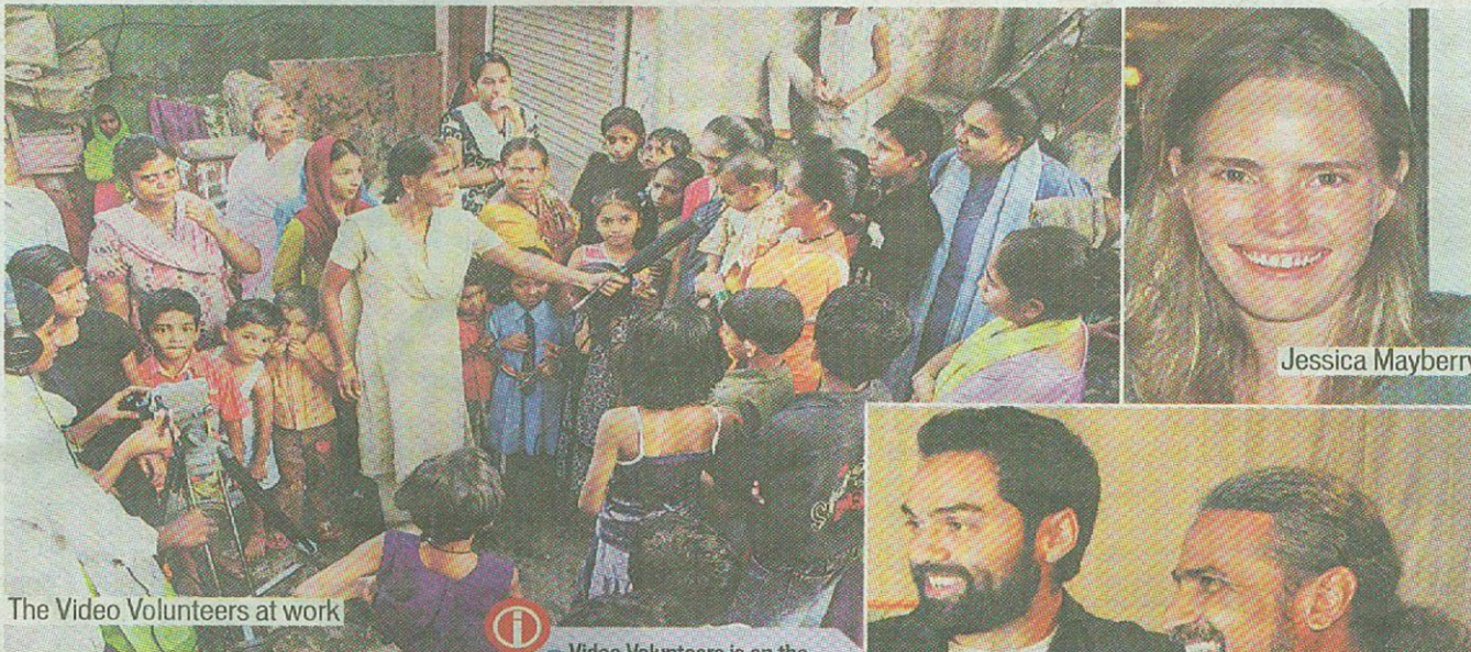
The Video Volunteers at work

The dream is to democratise Indian media, through documentaries shot by the least asked men